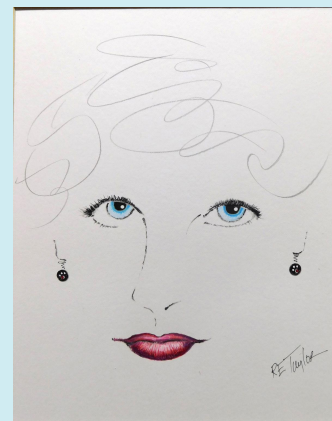
Exhibit Dates: February 4 – February 27

Receiving: February 1, 2021 10AM to 12PM