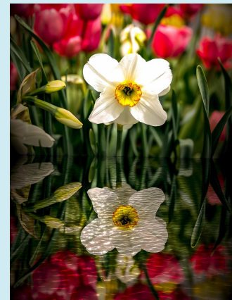
Exhibit Dates: April 1 – May 1